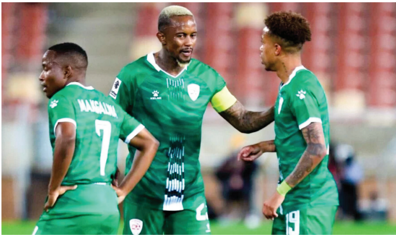
Sekhukhune United has released several players.