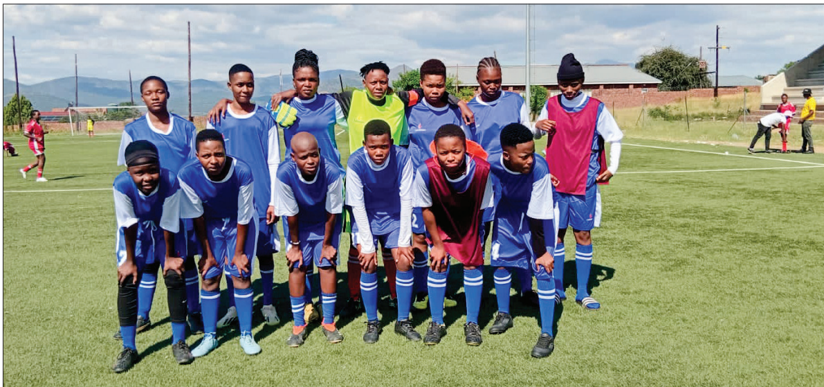
Thoto Ladies FC are log leaders of Stream B in the SAFA Sekhukhune Regional Women's Football League.

As the league continues to gain momentum, fans can expect thrilling matches and intense competition between teams.