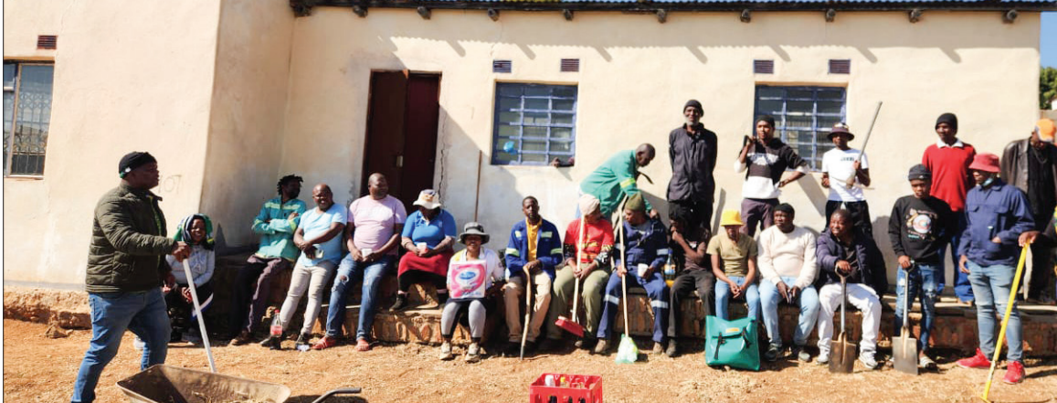
The Ga-Molepane community use a donated three-room house for shelter during the visit of the mobile clinic that comes in the village once per week.