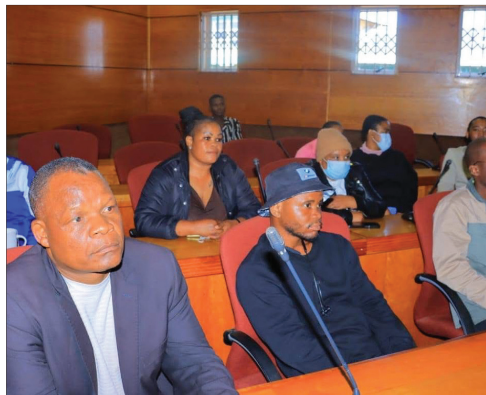
FTLM employees paying attention during the engagement with the Mayor, Eddie Maila, at the FTLM Municipal Chamber in Burgersfort.