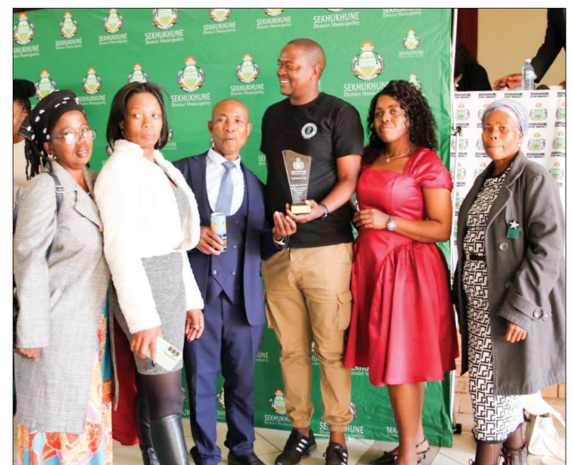
Top performing ward committee members receiving accolades during the Ward Committee Performance Awards ceremony held at the Moses Mabotha Civic Hall in Ga-Nkwana Village.