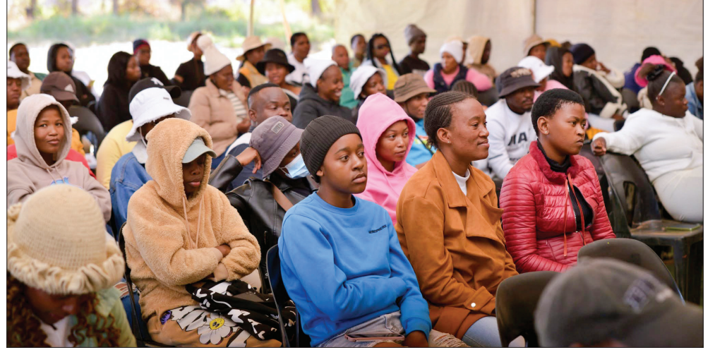
Young people from different villages of Ephraim Mogale villages get information from various institutions during the event.

The event also featured exhibitors from various organizations, including the