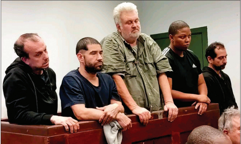
The suspects who were charged with manufacturing drugs at a farm in Loskop during their appearance at the Groblersdal Magistrate's Court.