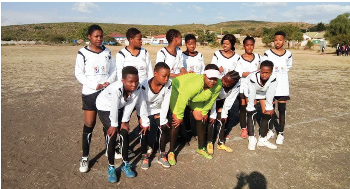
Milestone Ladies FC are among women's football teams determined to be crowned champions of the SAFA Sekhukhune Regional Women's Football League.