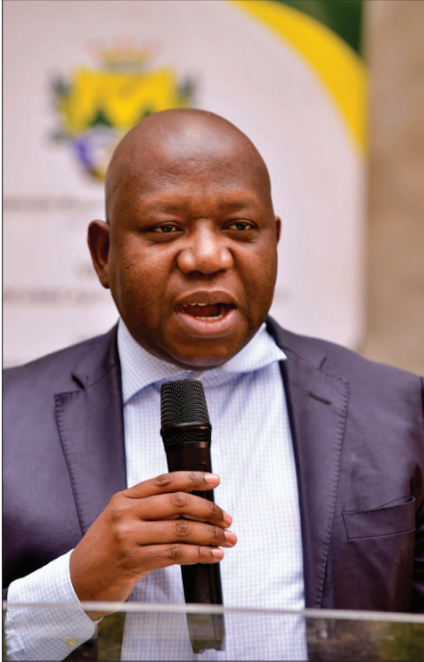
EPMLM Mayor, Cllr Given Moimana, addressing young people during Youth Information Sharing Day held in Marble Hall Sports Grounds.