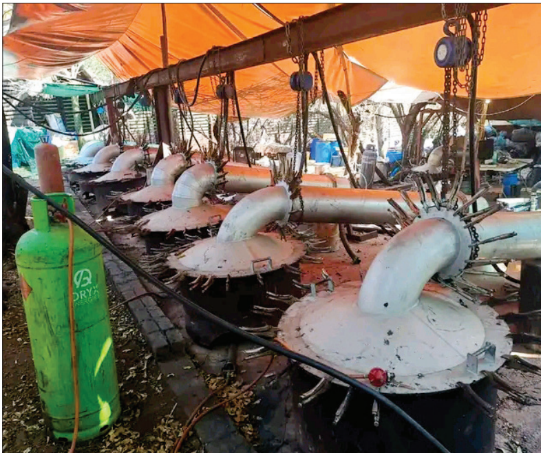
The drug laboratory with drugs worth over R2 billion was discovered by the Hawks at a farm in Loskop outside Groblersdal.